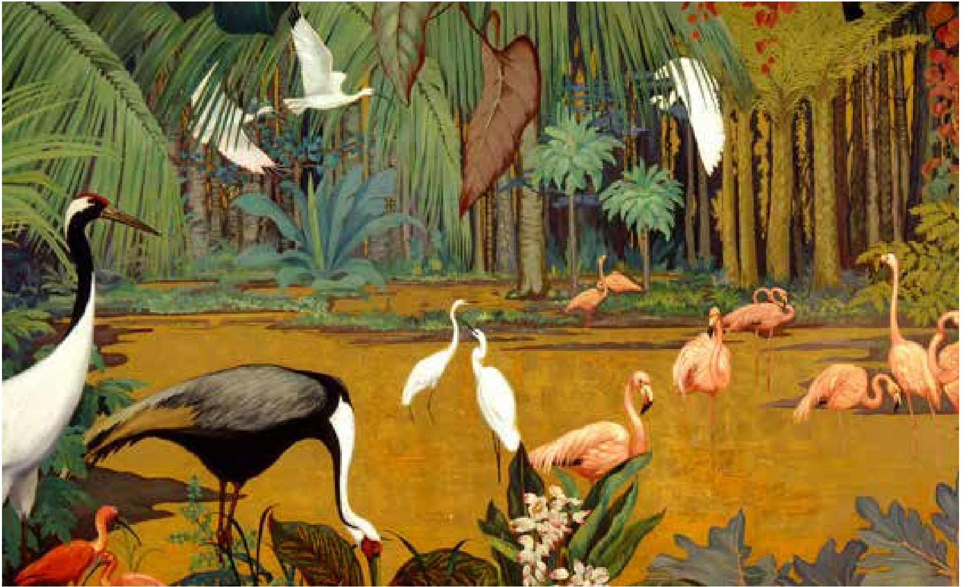
Mural featured at The Irvine Museum painted by Jessie Botke