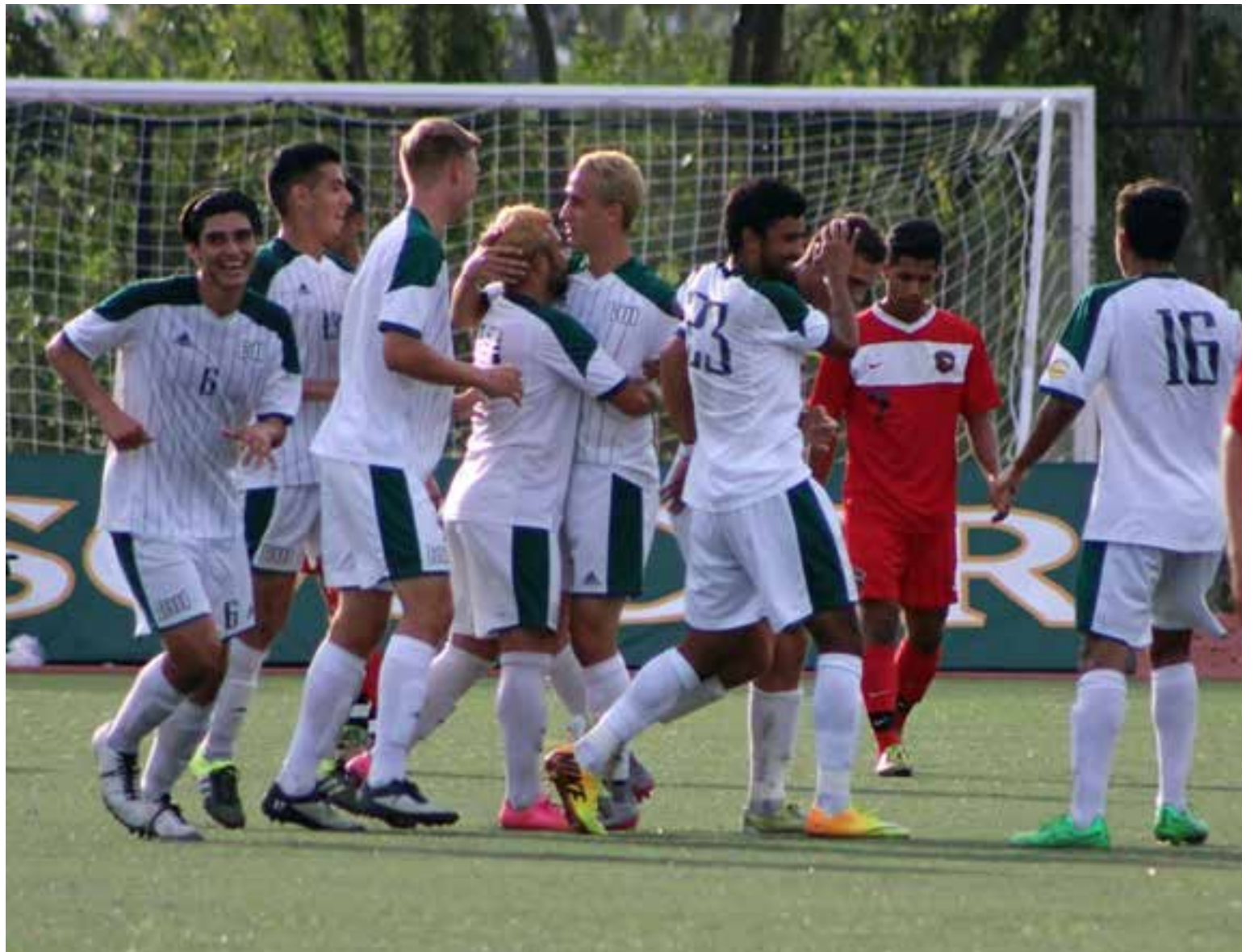
Concordia's Men's Soccer Team

we are proud of as far as their leadership." Yesterday, the men travelled to San Francisco to compete against Academy of Art. Tomorrow, they will head to Belmont to compete against Notre Dame de Namur University.